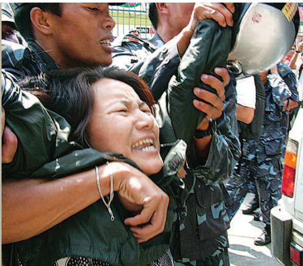
Officers harshly detaining a Tibetan protestor following a demonstration in Kathmandu on October 1, 2009.