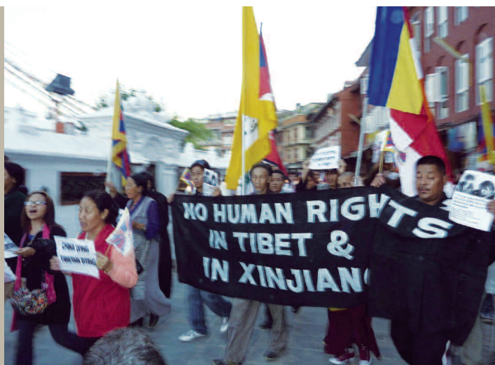
Tibetans gathered in Kathmandu on October 26, 2009 to demonstrate against the execution of four Tibetans in connection with the Lhasa protest of March 14, 2008.

In October 2009, ICT worked to assure that Tibetan voices were heard at the world’s biggest literary trade event, the Frankfurt International Bookfair, where the Chinese government was the guest of honor. ICT hosted a reading of Tibetan writings that are banned in Beijing. We published a ground-breaking collection of poetry and prose by Tibetans, including imprisoned writers, about the political situation in Tibet.