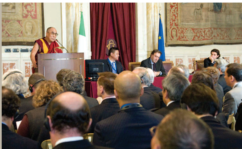
His Holiness the Dalai Lama addressing the 5th World Parliamentarian Conference on Tibet.

A highlight of its work was ICT-Germany’s presence at the International Frankfurt Bookfair in October. With the guest of honor being the People’s Republic of China, ICT put Tibet prominently on the agenda of the fair. Together with its supporter, German actor Hannes Jaenicke, ICT-Germany held “ The Forbidden Reading — Tibetan Political Literature ” at the fairgrounds, gaining significant public attention at the bookfair and in the media. Together with other ICT offices, ICT-Germany