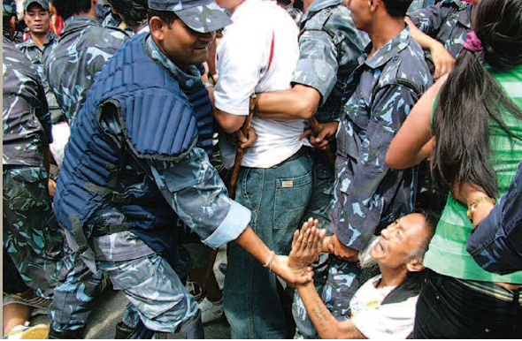
Tibetan protestors being forcibly detained following a demonstration in Kathmandu on October 1, 2009, the anniversary of the Chinese Communist Party's ascendency to power in China.